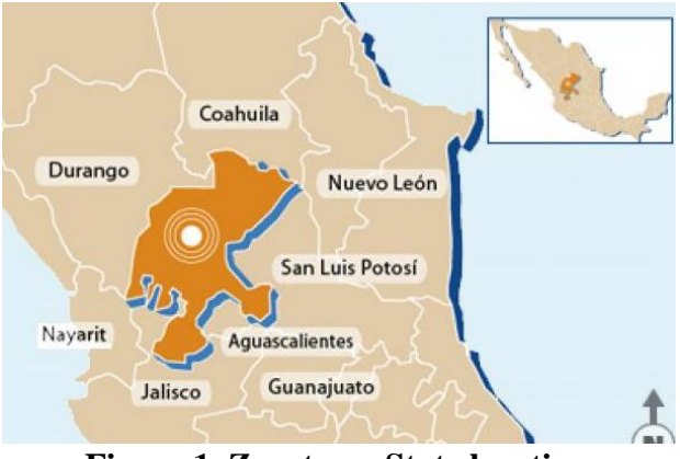
Figure 1. Zacatecas State location

<sup>40</sup>K were determined using its characteristic line of 1460.822 keV. For the Thorium series, <sup>208</sup>Tl (583.187 and 860.56 keV) and<sup>228</sup>Ac (911.196, 968.960 keV) were used. The Uranium series were evaluated trough <sup>214</sup>Pb (351.932 keV), <sup>214</sup>Bi (295.224 and 609.312 keV) [4]. The acquisition time for every spectrum was set to 7200 s, since it is enough time to achieve a standard error less than 2% under the <sup>40</sup>K photopeak. Energy and efficiency calibration of the spectrometer were done using a multinuclide standard with <sup>241</sup>Am (59.5 keV); <sup>109</sup>Cd (88.3 keV); <sup>137</sup>Cs (661.6 keV) and <sup>60</sup>Co (1173.23 y 1332.51 keV).