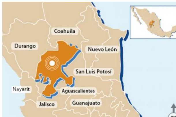
Figure 1. Zacatecas State location

^{40}\text{K} were determined using its characteristic line of 1460.822 keV. For the Thorium series, ^{208}\text{Tl} (583.187 and 860.56 keV) and ^{228}\text{Ac} (911.196, 968.960 keV) were used. The Uranium series were evaluated trough ^{214}\text{Pb} (351.932 keV), ^{214}\text{Bi} (295.224 and 609.312 keV) [4]. The acquisition time for every spectrum was set to 7200 s, since it is enough time to achieve a standard error less than 2% under the ^{40}\text{K} photopeak. Energy and efficiency calibration of the spectrometer were done using a multinuclide standard with ^{241}\text{Am} (59.5 keV); ^{109}\text{Cd} (88.3 keV); ^{137}\text{Cs} (661.6 keV) and ^{60}\text{Co} (1173.23 y 1332.51 keV).