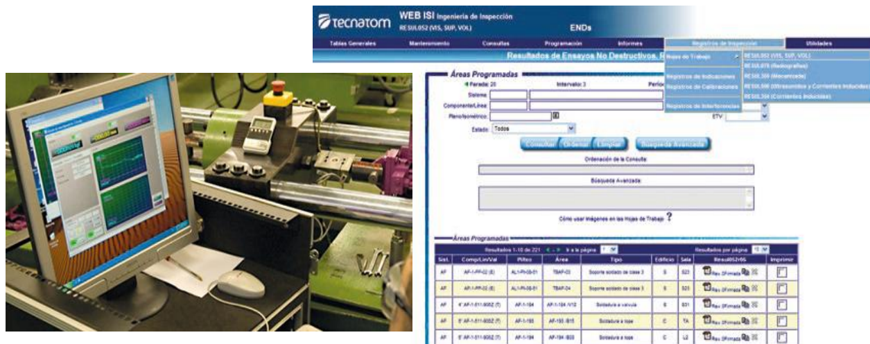
Figure 4. Inspection support tool: WebISI

The Spanish fleet is still in the process of refining the scope of the aging management programs. Some of the inspections related to the implementation of the AMP have already been performed to address specific operating experiences of the plants (e.g. a plant performed Guide Card Wear measurements and inspections, most plants have performed extended cables testing programs) or to accomplish with regulatory requirements. Other inspections are expected during 2017 and 2018, starting with the first reactor vessel internals inspections based on EPRI MRP-227/228 guidance 13, 14 for LTO.