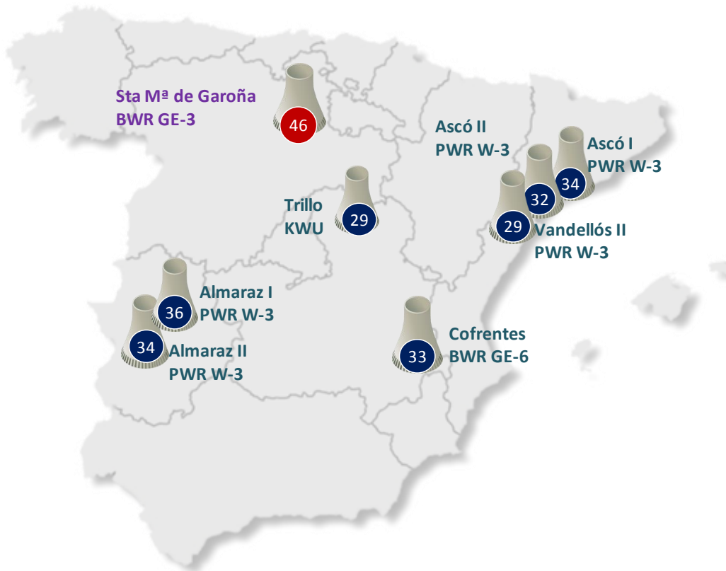
Figure 1. Spanish nuclear power plants: age and design

All the Spanish NPP are preparing the life extension, including Sta M a de Garoña, which has operated more than 40 years and is performing work to meet post-Fukushima requirements.